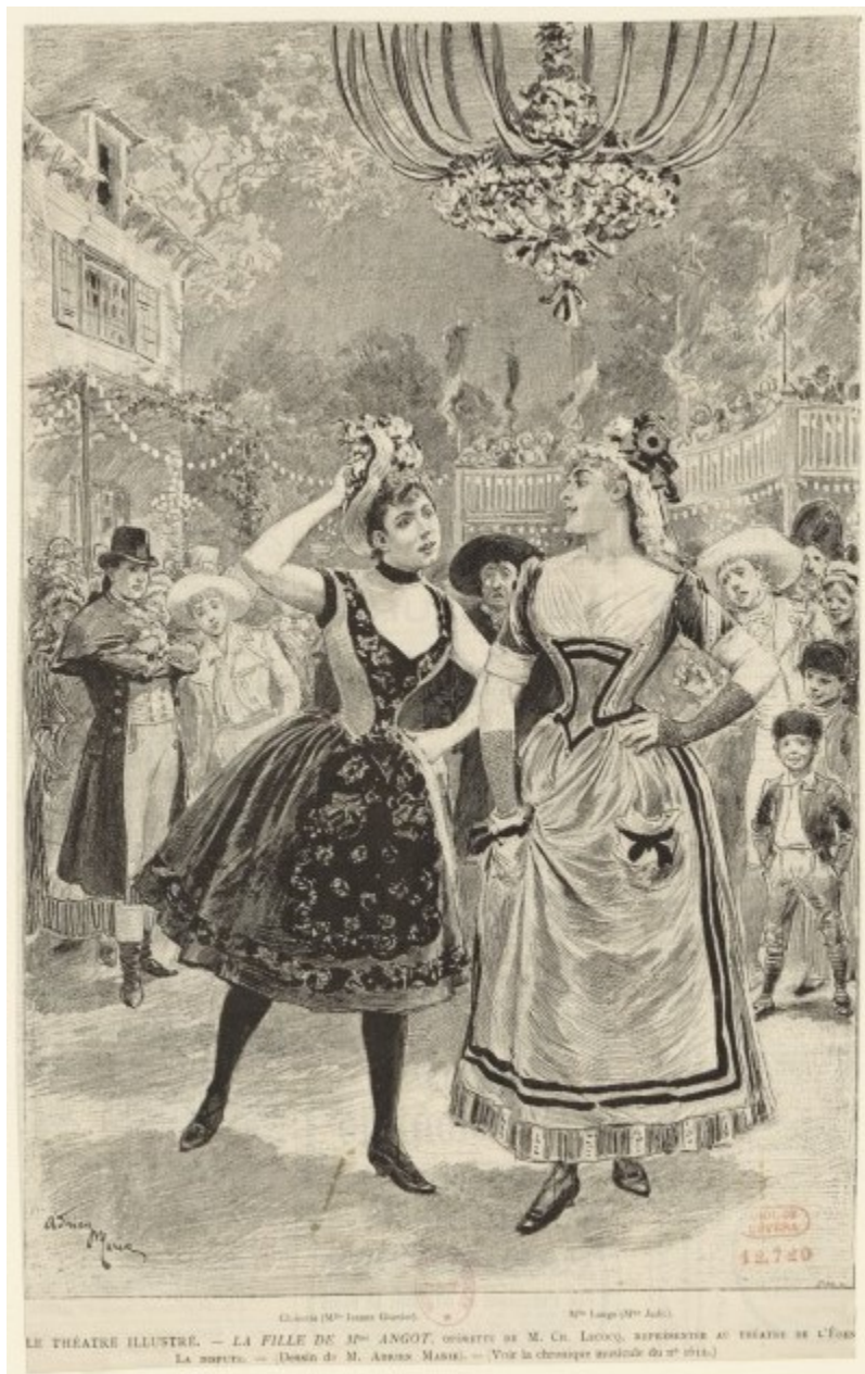
Fig. 11, Anna Marie Louise Damiens Judic (right) wearing a costume by Félix in the role of Madame Langué in La fille de Madame Angot, by Charles Lecocq, Éden-Théâtre, Paris, 1888. Bibliothèque Nationale de France, Paris. Artwork in the public domain; [return to text]