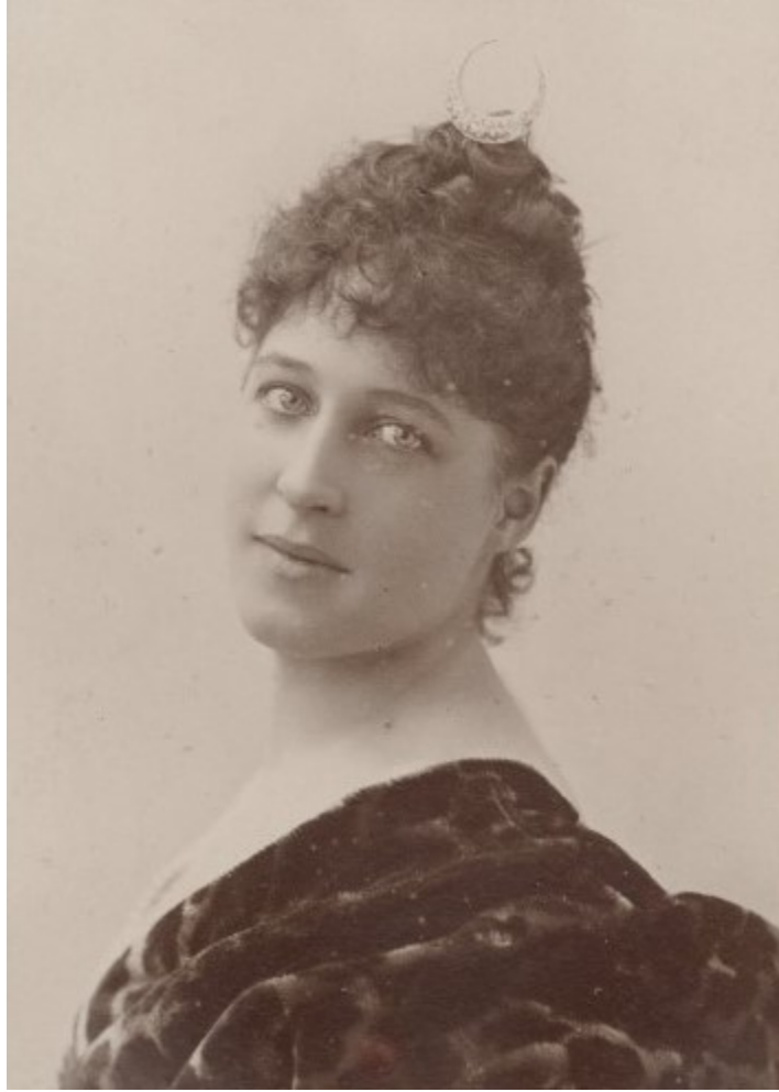
Fig. 7, Atelier Nadar, Lillie Langtry , ca. 1880s–90s. Photograph. Artwork in the public domain; image courtesy of Bibliothèque Nationale de France, Département Estampes et Photographie. [return to text]