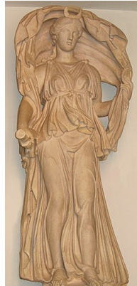
Fig. 6, Selene , Roman, first century AD, after Greek original, fourth century BC. Marble. Capitoline Museums, Rome. Artwork in the public domain;