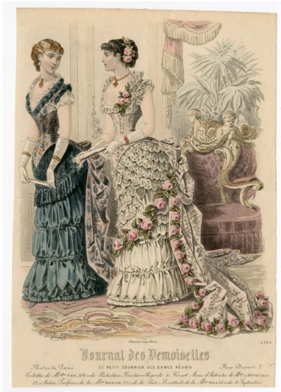
Fig. 9, Journal des Demoiselles , 1883. Costume Institute Fashion Plates, The Metropolitan Museum of Art, Gift of Woodman Thompson. Artwork in the public domain; image © Metropolitan Museum of Art.