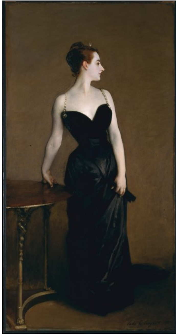
Fig. 1, John Singer Sargent, Madame X (Madame Pierre Gautreau) , 1883–84. Oil on canvas. The Metropolitan Museum of Art, New York. Artwork in the public domain; image © The Metropolitan Museum of Art. [return to text]