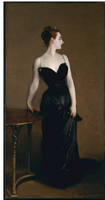
Fig. 1, John Singer Sargent, Madame X (Madame Pierre Gautreau), 1883–84. Oil on canvas. The Metropolitan Museum of Art, New York. Artwork in the public domain; [larger image]

When Virginie Amélie Avegno Gautreau (1859–1915) presented herself in French society, both in Paris and at her country home, Les Chênes, in Paramé, people would gather to witness her beauty. Her renown made the papers throughout France, England, and the United States—from Maine to California. With her fair skin, red, upswept hair, and shapely figure, she was repeatedly described in classical terms: “a statue of Canova transmuted into flesh and blood and bone and muscle,” by one account. [1] When it came to the reviews of John Singer Sargent’s portrait of her for the Salon of 1884, the infamous Madame X , however, the critics panned the painting as displeasing and unnatural, calling out the atrocious pale skin and the indecorous draping right strap (later repainted) of the formfitting black dress (figs. 1, 2).