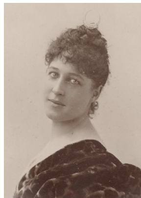
Fig. 7, Atelier Nadar, Lillie Langtry , ca. 1880s–90s. Photograph. Artwork in the public domain; image courtesy of Bibliothèque Nationale de France, Département Estampes et Photographie. [larger image]