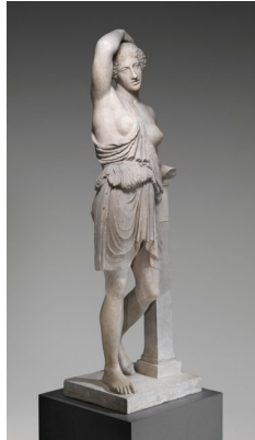
Fig. 12, Wounded Amazon, Roman copy of a Greek original of the fifth century BC. Marble. The Metropolitan Museum of Art, New York. Artwork in the public domain; [larger image]

The American actress Mary Anderson starred as Galatea, Pygmalion's living statue, in the aforementioned performance of Gilbert's play in 1883. Cabinet cards offer a sense of how her classical costume was interpreted on stage—in one image the upper right armband is in the same placement as Gautreau's strap (see fig. 3). [71] The same year, Anderson also played the role of Parthenia in Friedrich Halm's Ingomar, the Barbarian in London, for which images also circulated. [72] For Gautreau's classical enactment in Sargent's painting, her pale skin appears as smooth as alabaster, especially in cameo-like contrast to the black dress and red hair. [73] Her right hand grasps the top of a mahogany table, its legs decorated with what appear to be Sirens, mythic winged female figures known for their alluring, but dangerous singing, perhaps a reference to Gautreau's reputation as a chanteuse. [74] Finally, she stands in a timeless, nondescript space.