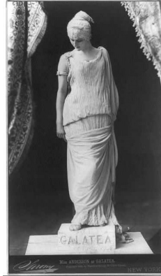
Fig. 3, Napoleon Sarony, Mary Anderson as Galatea , ca. 1883. Photograph. Artwork in the public domain; image courtesy of Library of Congress. [larger image]