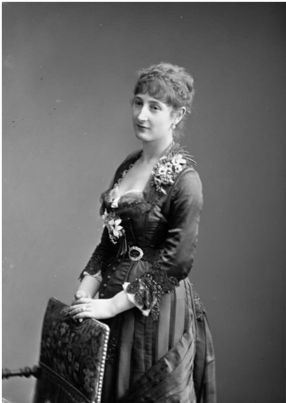
Fig. 5, Virginie Amélie Avegno , ca. 1878. Photograph. Artwork in the public domain; image courtesy of Médiathèque de l'Architecture et du Patrimoine, Charenton-le-Pont, France. [return to text]