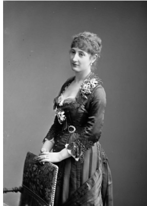
Fig. 5, Virginie Amélie Avegno , ca. 1878. Photograph. Artwork in the public domain; image courtesy of Médiathèque de l'Architecture et du Patrimoine, Charenton-le-Pont, France. [larger image]

The pictures, by an unknown photographer, are striking in their conventionality. After her marriage and introduction into French society, Gautreau was known for her conspicuousness and eccentricity. Her fashion taste and arresting appearance were the subjects of fervent comment. In 1880, a writer for the New York Herald expounded: