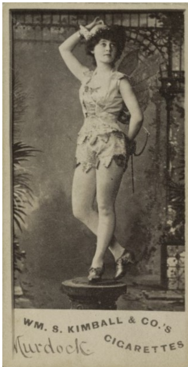
Fig. 8, Daisy Murdoch , issued by William S. Kimball & Company, 1889. Commercial color lithograph. The Metropolitan Museum of Art, The Jefferson R. Burdick Collection, New York. Artwork in the public domain; image © Metropolitan Museum of Art. [return to text]