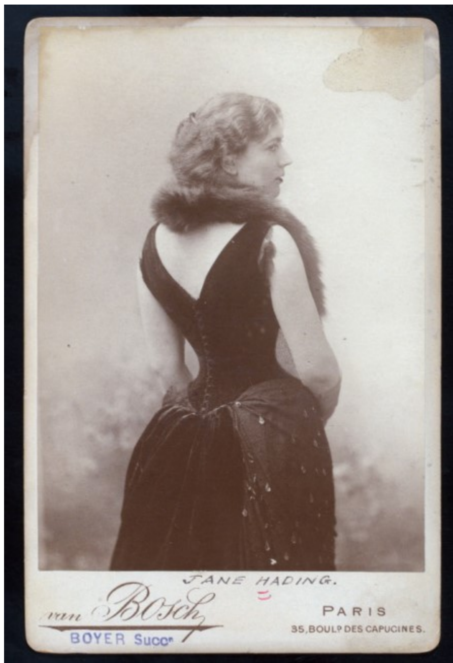
Fig. 10, Jane Hading, ca. 1885. Cabinet card. [return to text]