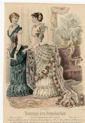
Fig. 9, Journal des Demoiselles , 1883. Costume Institute Fashion Plates, The Metropolitan Museum of Art, Gift of Woodman Thompson. Artwork in the public domain; image © Metropolitan Museum of Art.

Having a new understanding of Gautreau's penchant for a classically inspired presentation, it is now possible to look anew at Madame X and detect an effort to maintain that style in her painted representation. She is positioned in a cameo profile, and her red, upswept hair is ornamented by the crescent. The two-piece satin and velvet dress is unembellished aside from the jeweled straps, differing from the lacey, bustled designs that were then promoted in fashion magazines (fig. 9). Justine De Young recently demonstrated that although unusual, the dress in Madame X is not an anomaly for the early 1880s, citing sitters wearing black dresses with plunging necklines in Sargent's portrait Mrs. Harry Vane Milbank of 1883–84 (private collection), and in two portraits of Madame Louis Singer in 1884 by Paul Jacques Aimé Baudry (Musée du Petit Palais, Paris, and private collection). She also specifies an evening dress by Hoschedé Rebour's of about 1885 in the Metropolitan Museum of Art. [56] To this group may be added the cabinet cards of actress Jane Hading, also a client of Félix, in a black velvet dress with a plunging neck and back line from about 1885 (fig. 10). [57]