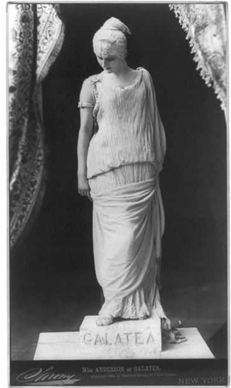
Fig. 3, Napoleon Sarony, Mary Anderson as Galatea , ca. 1883. Photograph. Artwork in the public domain; image courtesy of Library of Congress. [return to text]